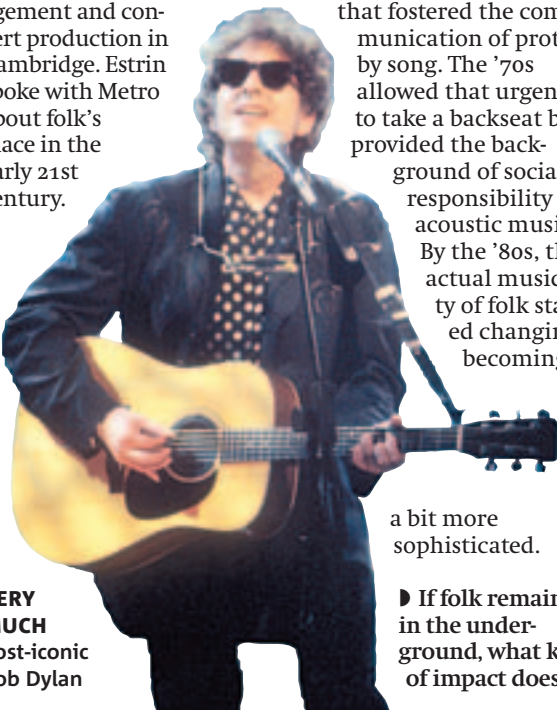
A VERY MUCH post-iconic Bob Dylan